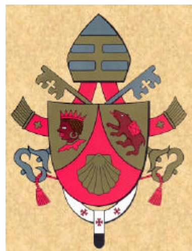
Pope Benedict XVI

“He lived out that profoundly human vision of priestly ministry in his devoted care for the people of Birmingham during the years that he spent at the Oratory he founded, visiting the sick and the poor, comforting the bereaved, caring for those in prison. No wonder that on his death so many thousands of people lined the local streets as his body was taken to its place of burial not half a mile from here. One hundred and twenty years later, great crowds have assembled once again to rejoice in the Church’s solemn recognition of the outstanding holiness of this much-loved father of souls. What better way to express the joy of this moment than by turning to our heavenly Father in heartfelt thanksgiving, praying in the words that Blessed John Henry Newman placed on the lips of the choirs of angels in heaven: