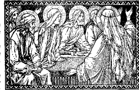
A little while, and now you shall not see Me

The season of Eastertide lasts for eight weeks, during which time we celebrate the resurrection, the appearances of the Risen Lord to the disciples, and His preparing them for His Ascension and for the Coming of the Holy Spirit. So today, the last Sunday before the Feast of the Ascension, Our Lord tells His disciples that He is about to leave the world to return to the Father. But this does not mean that the disciples will be bereaved of His presence; He promises to send the Holy Spirit, who will lead Our Lord's followers into all truth, and who